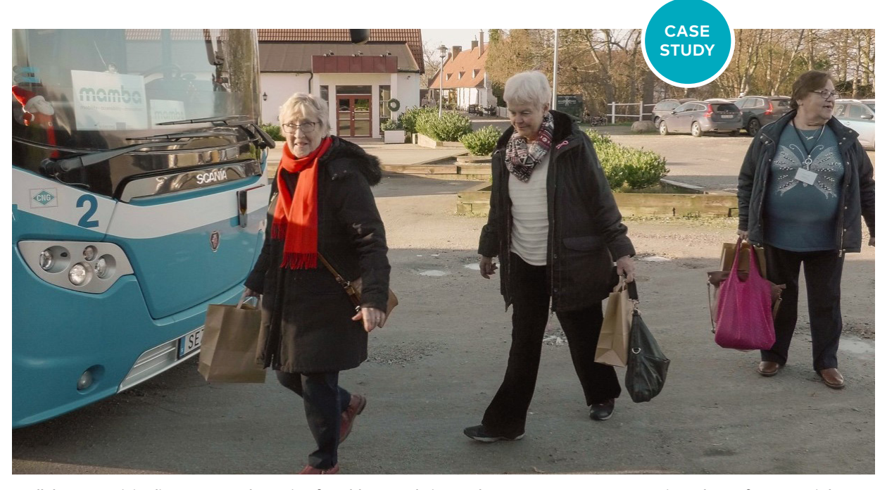
Trelleborg Municipality arranges bus trips for older people in rural areas as an event per se, in order to foster social interaction among participants.

As mentioned above, Germany has already made good progress, including representation for disabled people in the public transport planning process, which became a legal obligation for providers. The country aims for public transport to be